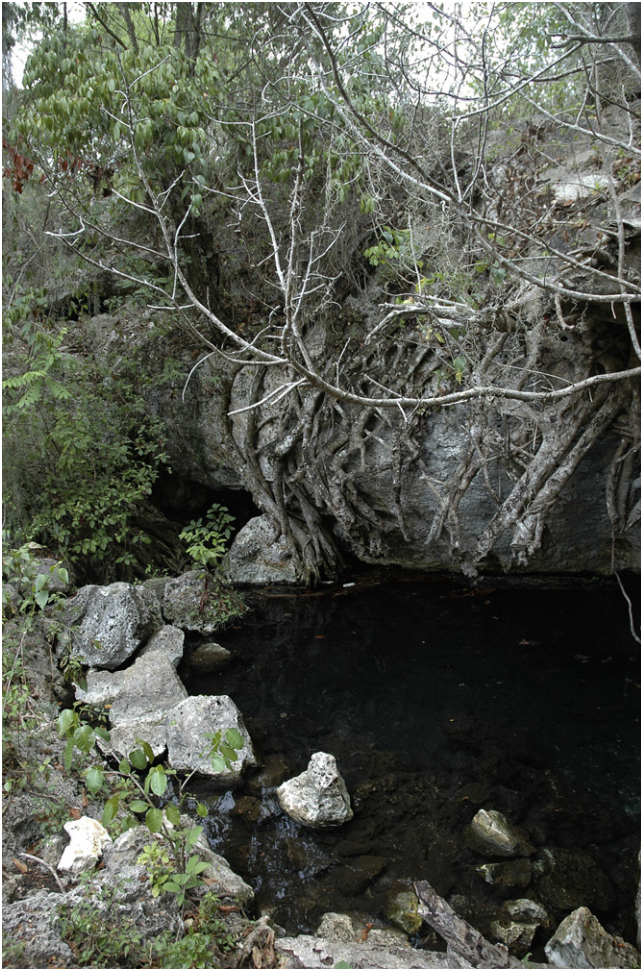
Figure 1. Entrance to the Padre Nuestro cave, a part of the Padre Nuestro cave complex in southeastern Dominican Republic.

The only extinct species formally described is Antillothrix bernensis , based on the type maxilla preserving P^3 – M^1 , root sockets for C^1 and P^2 , and a referred fragmentary mandible with M_2 (Rímoli, 1977; MacPhee and Woods, 1982; MacPhee et al., 1995). Another specimen consisting of a skull reassembled from fragments, associated with postcranial bones of a young adult Antillothrix , was reported after submission of this manuscript (Rosenberger et al., 2010).